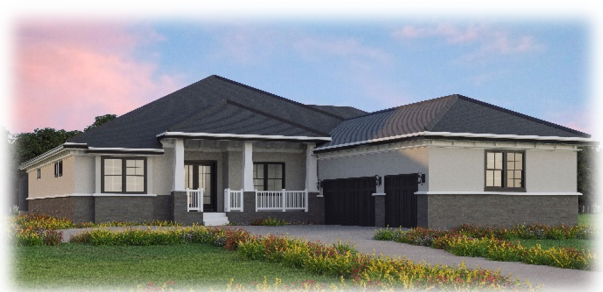
1875 Kingsdown Drive, Sarasota, Florida 34240 Total Finished- 3,315 SQFT 4 Bed, 5 Bath Lot- .83 Acres